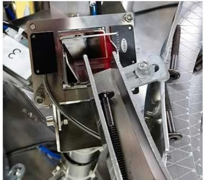
Transfer to packaging machine for packaging.