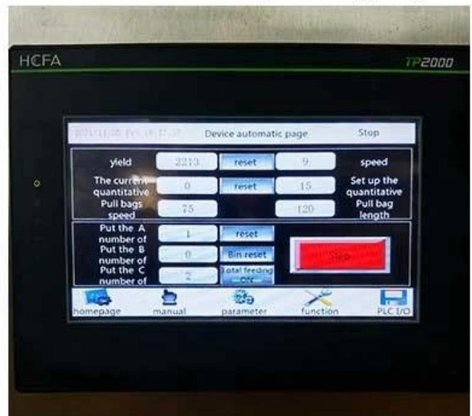
Simple operation of Chinese and English settings