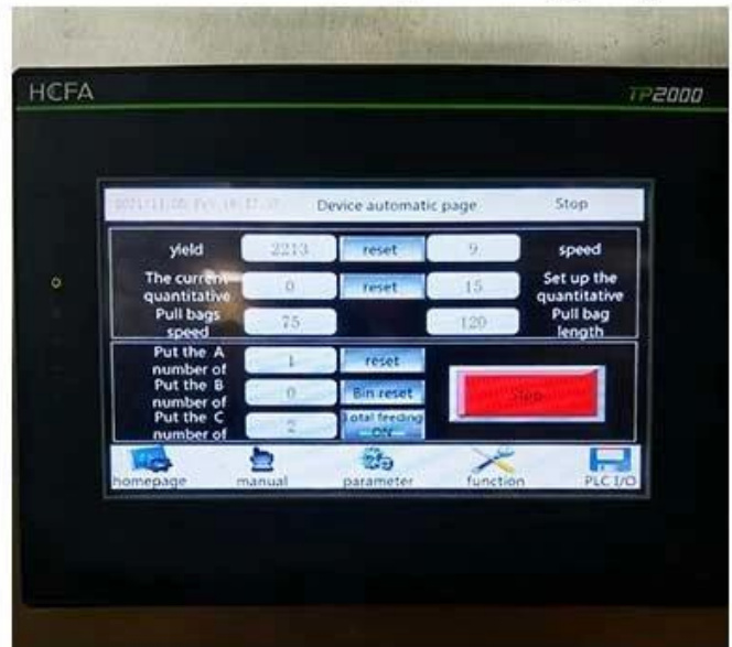
Simple operation of Chinese and English settings