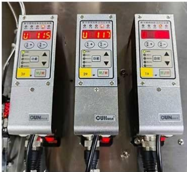
The accessory machine is running at the same time.