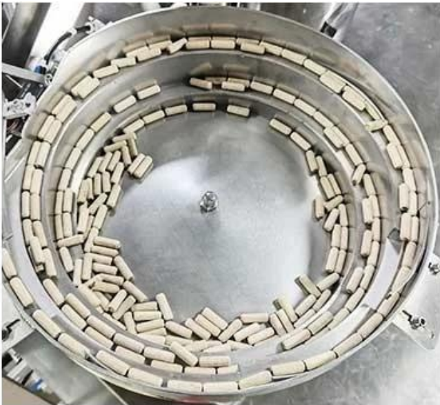
Accessories are put into the machine