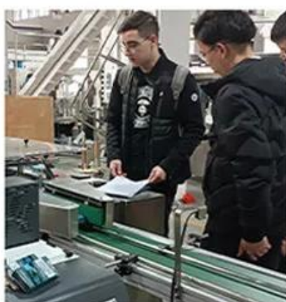
5. Factory acceptance