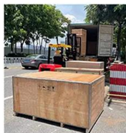
6. Packaged and shipped

Professional engineers provide technical support to customers.