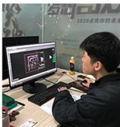
2. Design drawings