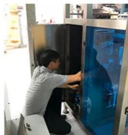
3. Machine production