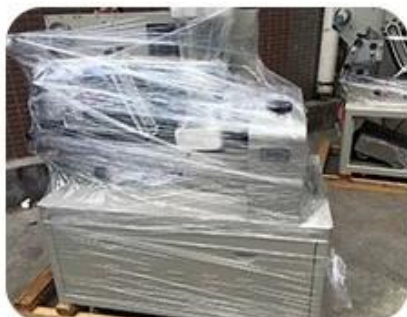
Clean and film up after adjustment