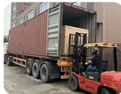
Loading and deliver