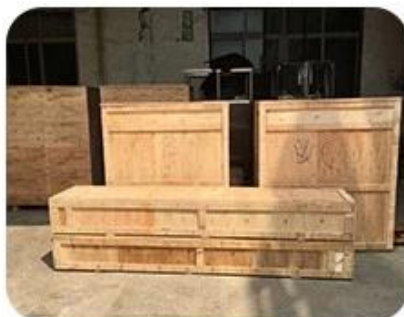
Pack in wooden case