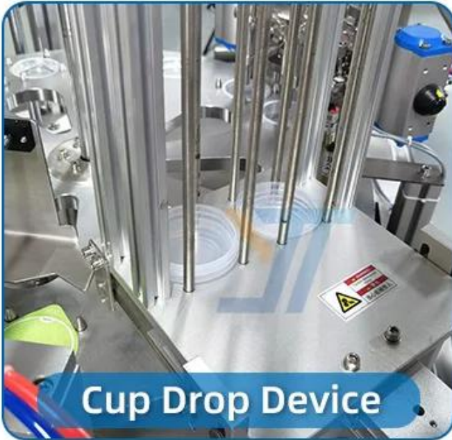
Cup Drop Device

Strict quality control system, the quality of the machine is stable and reliable