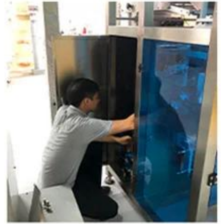
3. Machine production