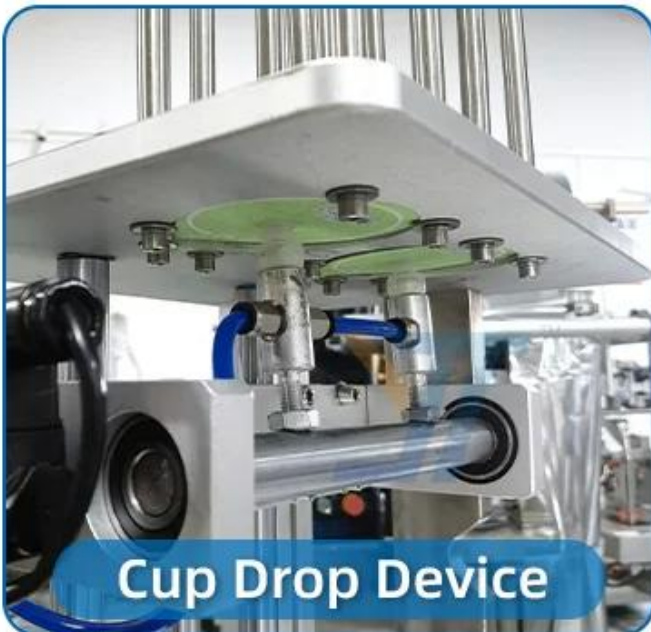
Cup Drop Device

Filling without leakage, accurate measurement, and adjustable filling volume.