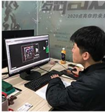
2. Design drawings