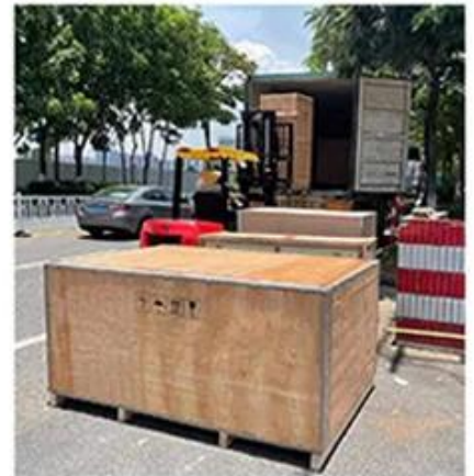
6. Packaged and shipped

Professional engineers provide technical support to customers.