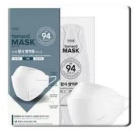
Flat Mask Packed