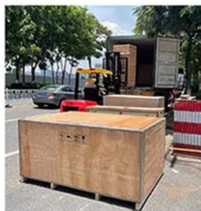
6. Packaged and shipped

Professional engineers provide technical support to customers.