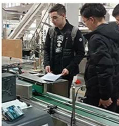
5. Factory acceptance