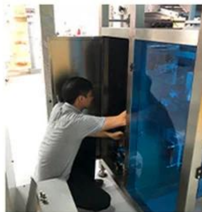
3. Machine production