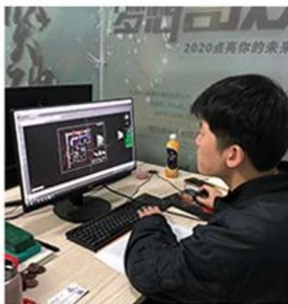
2. Design drawings