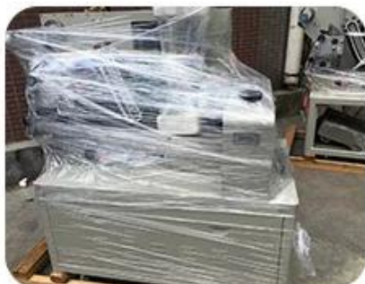
Clean and film up after adjustment