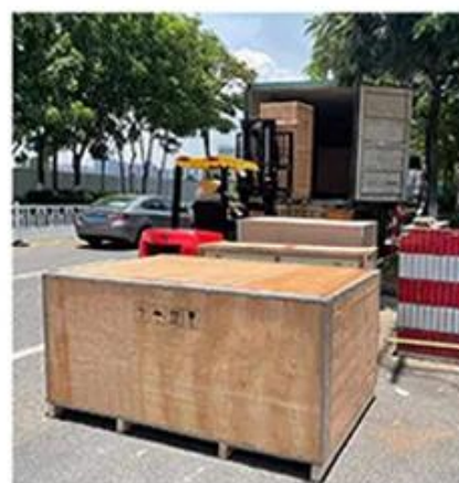
6. Packaged and shipped

Professional engineers provide technical support to customers.