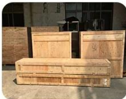
Pack in wooden case