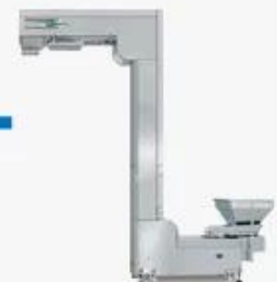
Z Type Feeding Machine