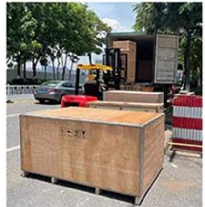
6. Packaged and shipped

Professional engineers provide technical support to customers.