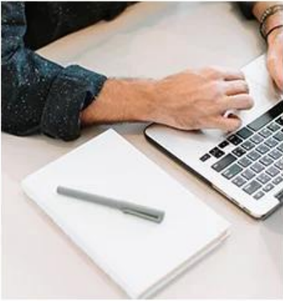
1. Set a strategy