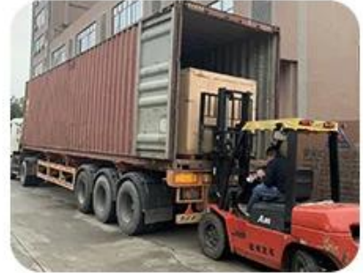
Loading and deliver