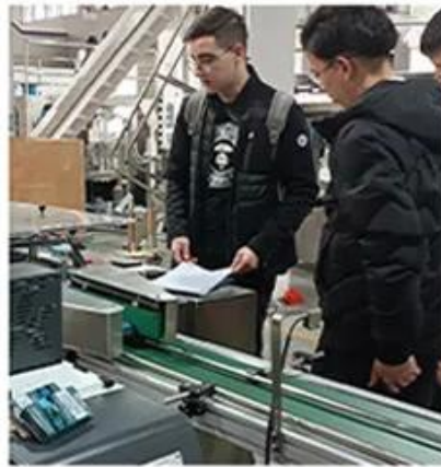
5. Factory acceptance