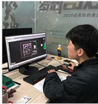
2. Design drawings