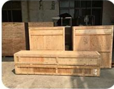
Pack in wooden case