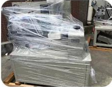
Clean and film up after adjustment