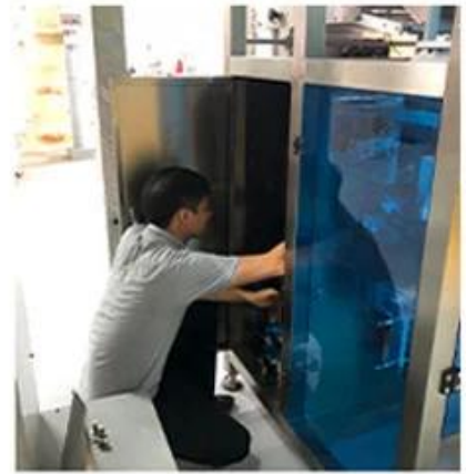
3. Machine production