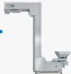
Z Type Feeding Machine