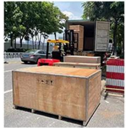
6. Packaged and shipped

Professional engineers provide technical support to customers.