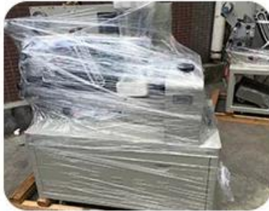
Clean and film up after adjustment