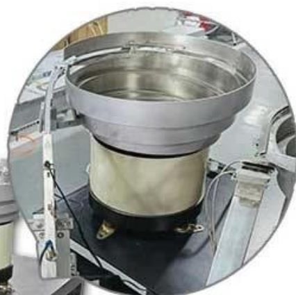
Selling point 2