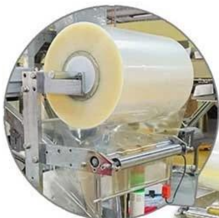
Selling point 1