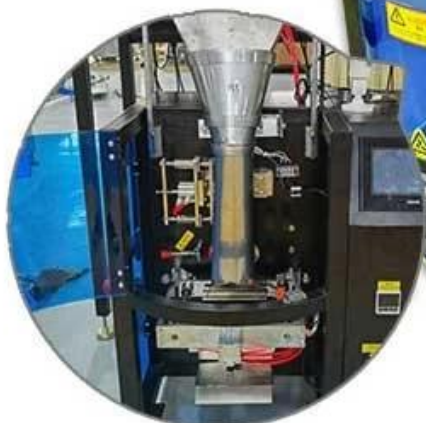
Selling point 3