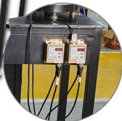
Selling point 4