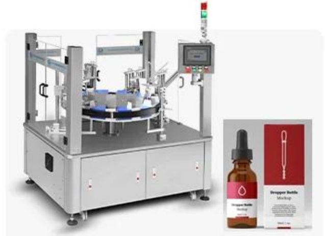
Vertical cartoning machine