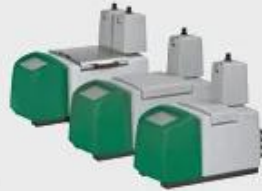
Hot melt machine