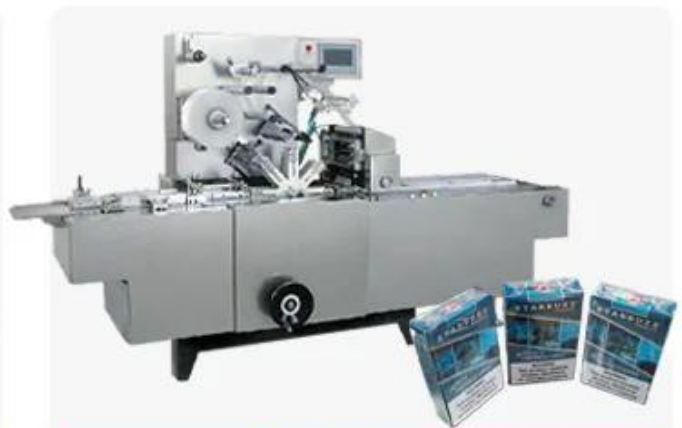
Cellophane Packaging Machine