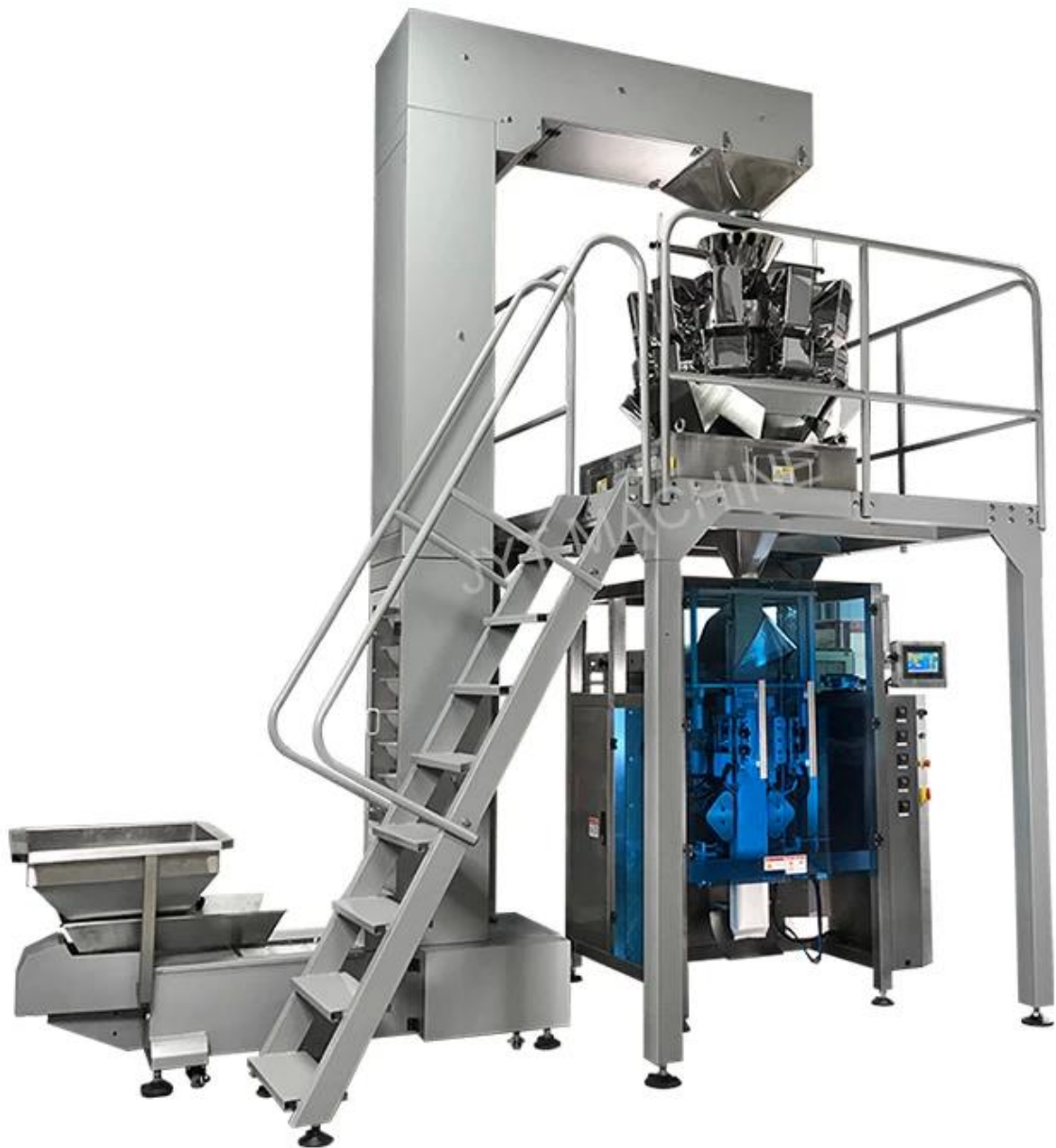
coffee bean packing machine factory